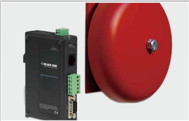
Powerful Alarm Management

Built-in Exclusive Video Playout Control technology that enables smooth video and limiting of video quality degradation for different situations like uniform Camera Time Stamp, Unstable Network Conditions.