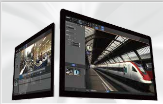
16ch Full HD Real-time Display on Dual Monitors

GVD advanced software features MVP, ROI, Turbo Mode Plus functions to offer powerful performance video recording and display for 16ch Full HD real-time display on dual monitors.