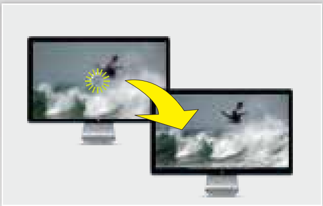
Smooth Video with Exclusive Video Playout Control

GVD advanced software features MVP, ROI, Turbo Mode Plus functions to offer powerful performance video recording and display for 16ch Full HD real-time display on dual monitors.