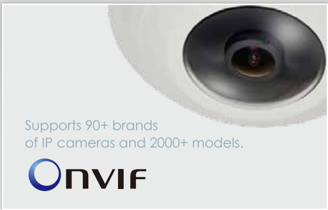
Supports Onvif Profile S & Onvif

Alarm notification by Pop-up, E-mail, DI/DO (Modbus Support) when video loss, sensor triggered, HDD crashed, system crashed, abnormal transaction, e-fence, video motion detection, etc.